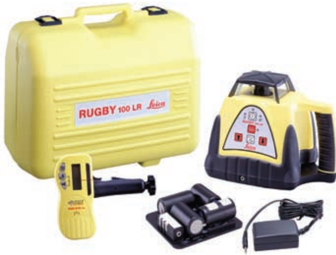
Typical package consists of laser, carrying case, ROD-EYE Pro sensor and optional NiMH charger and battery pack